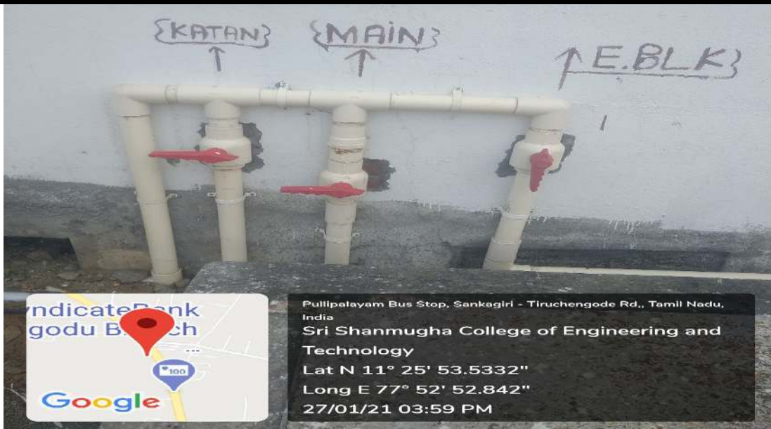
Water Distribution system from main line to Engineering Block Ground Tank

Website: www.shanmugha.edu.in Contact Number: 04283-262901