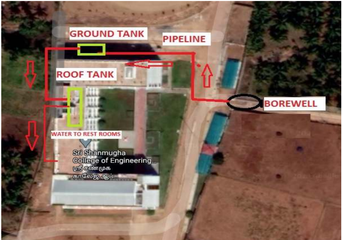
Satellite View of Water Distribution System in Engineering Building

Website: www.shanmugha.edu.in Contact Number: 04283-262901