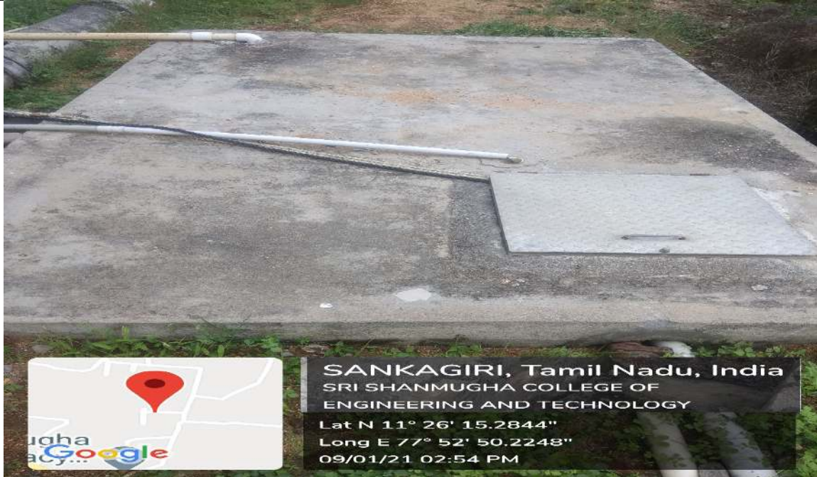
Water Stored in Ground Tank

Website: www.shanmugha.edu.in Contact Number: 04283-262901